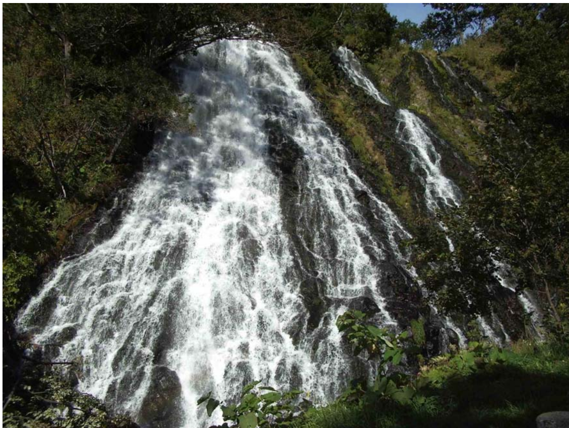
Japan's Third World Natural Heritage Site, Shiretoko in Northeastern Hokkaido